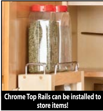
Chrome Top Rails can be installed to store items!